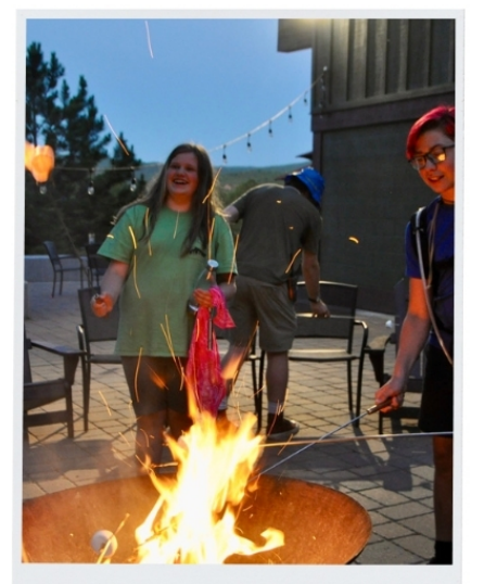
S'MORES OF COURSE

Cathedral Ridge invites you to unplug, relax and delight in the beauty of God's creation. Enjoy a long weekend of delicious meals, arts & crafts, hikes, high ropes and archery, field games, worship, s'mores and more. Each family stays in a private room in Lupine Lodge. Intergenerational and age-appropriate activities will be offered. Episcopal clergy will serve as chaplains and lead Sunday's outdoor Eucharist. Come and join us for a time of rest and renewal.