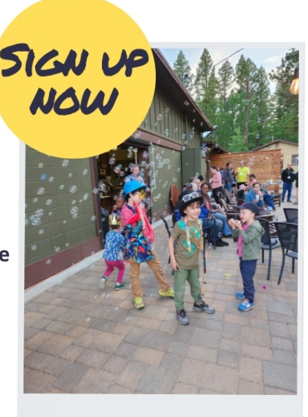
ITS BUBBLES TIME

I want to invite you to come and share in our youth or family camps this summer as we celebrate our Unity in Christ and our Diversity as members of the Body of Christ. We provide an atmosphere of caring and acceptance in all our camping programs. Children, youth and adults work, play, and grow together as they develop a community of trust, openness and sharing. Everyone is nurtured and cared for as a valued member of the Body of Christ! I look forward to seeing you this summer at Cathedral Ridge!